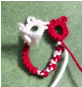
Joining of Ring A with Ring B after changing colors position.