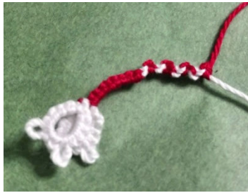
First chain. Half regular double stitches and half ric rac chain.